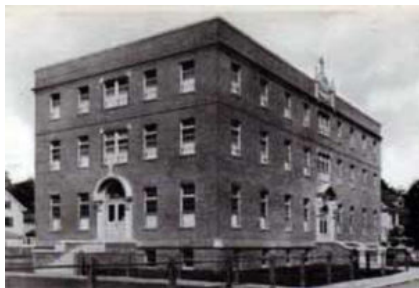
On September 13, 1925, the new Blessed Sacrament School opened with 454 children enrolled and ten FCJs on staff.

The Rhode Island Catholic , the newspaper of the Diocese of Providence, Rhode Island, has published an article to celebrate the Bicentenary of the FCJ Sisters. The article describes and celebrates the presence and contribution of the sisters in the Diocese: