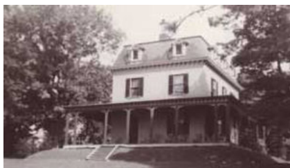
St. Philomena Convent, Portsmouth, Rhode Island opened in 1927 as a summer vacation home for the communities of Fitchburg, Gilbertville and Providence.