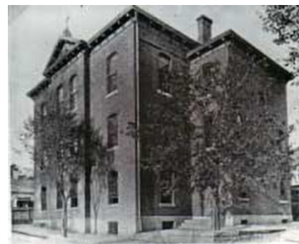
St. Patrick's High School for Girls in Providence was opened on September 11, 1933

The religious sisters also taught at St. Patrick's High School from 1933 until 1984 when changing times led to regionalization of high schools. The Faithful Companions of Jesus were recognized as amazing educators.