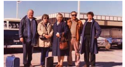
The first FCJs to live and work in South America established the house in Córdoba, Argentina, in 1985, in a poor parish on the outer rim of this city, the second largest in Argentina, working with the La Salette Missionaries