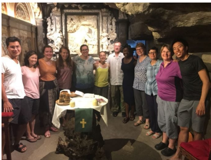
Group in the cave at Manresa

I was overjoyed to have had the chance to lead and complete this pilgrimage and it was made even more special when I asked you for prayer intentions to carry and pray for on the way but particularly in Montserrat and Manresa. I prayed for all the intentions of those who got in touch and for many others who came to mind as I walked along and for our whole Society. It was a real moment of union of mind and heart and I was so blessed to receive your prayer intentions and carry them with me so thank you for entrusting them to me as we walked along.