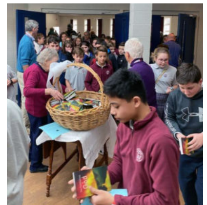
Students receiving The Faithfulness of God booklet after the school Mass