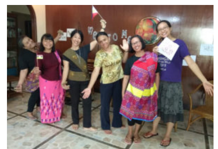
Some of the FCJ sisters of the Manila community.

Lord, God of all peoples, We mark this day To declare not our independence, but our interdependence. We are all created by the same God And share the same eternal destiny. We are called to live together in harmony and peace, As one family in the Lord. May we learn to love, To accept and to forgive, To heal and to nurture, And to celebrate all the beauty in diversity Of the earth we call home. We ask this through Christ, our Lord. Amen.