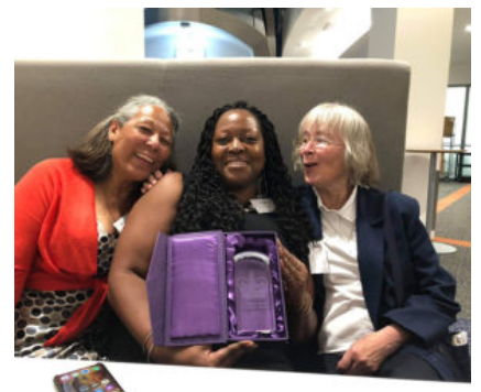
Members of the Neighbours in Poplar with the award

Follow Neighbours in Poplar on Twitter @SisterChristine