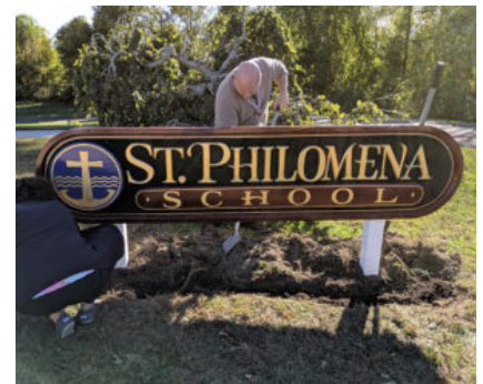
Planting daffodils near St Philomena School entrance in October 2019

Please plant this daffodil bulb as a symbol of solidarity with the Sisters, FCJ as they celebrate 200 years! St. Philomena students have pledged to support our Sisters in their efforts to help the environment. Please remember to : Refuse, Reduce, Reuse and Recycle! In April, give thanks for our Sisters, the Faithful Companions of Jesus!