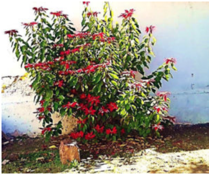
This plant, which you may associate with Christmas, in full bloom in a backyard, approx. two and a half meters high!