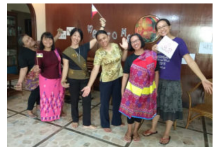
Some of the FCJ sisters of the Manila community.

Lord, God of all peoples, We mark this day To declare not our independence, but our interdependence. We are all created by the same God And share the same eternal destiny. We are called to live together in harmony and peace, As one family in the Lord. May we learn to love, To accept and to forgive, To heal and to nurture, And to celebrate all the beauty in diversity Of the earth we call home. We ask this through Christ, our Lord. Amen.