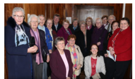
FCJ Sisters present at the Opera House gala.