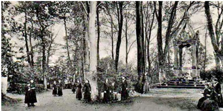
The grounds of the FCJ boarding school for girls at Bagatelle, Guernsey