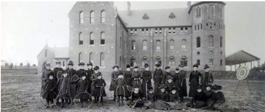
Genazzano College, founded in 1889. The property in Kew was originally secured as an all-girls' boarding school by the twelve founding Sisters who had set sail from England in 1882, to help meet the growing need for Catholic Education in Australia. Together with William Wardell, an eminent colonial architect, they oversaw the construction of the stunning Wardell Building in 1889, and in April 1891 the Sisters and their pupils took possession of their new College.