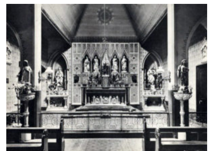
Upton Hall Convent Chapel about 1910