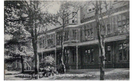
Sedgley Park Training College, Manchester, , c. 1919

1896: Fitchburg, Massachusetts, USA 1901: Gilbertsville, Massachusetts, USA 1900: Benalla, Eastern Victoria, Australia 1902: Graty, Belgium 1903: Fribourg, Switzerland 1904: Brussels, Belgium 1904: Namur, Belgium 1904: Sedgley Park, Manchester, England 1908: Guernsey, Channel Islands 1909: Salzennes, Belgium 1911: Hawthorn, Melbourne, Australia 1912: Cliftonville, Kent, England 1913: Broadstairs, Kent, England 1913: Jersey, Channel Islands 1910: Edmonton, Canada – St Anne’s