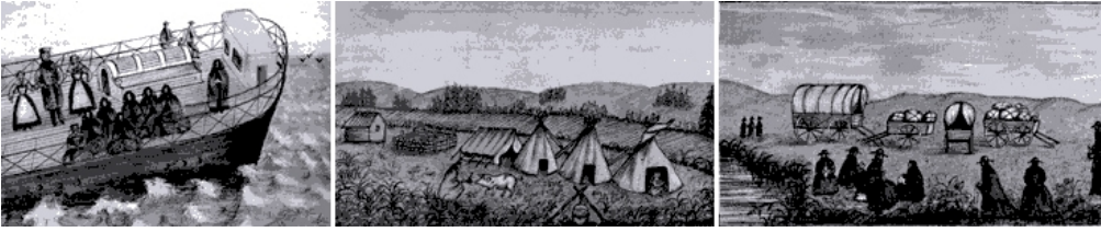
The voyage of the pioneer sisters to Canada, 1883. Pictures sent by the travelers.

1883: St Laurent 1883: Prince Albert 1883: Brandon, Manitoba 1885: Calgary 1888: Edmonton