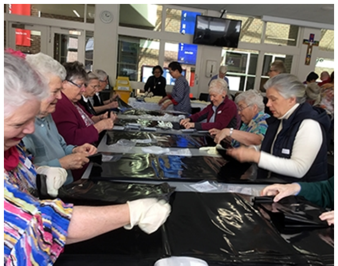
Companions in Mission and FCJ Sisters making birthing kits in Australia.