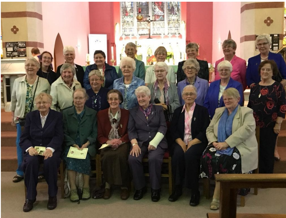
FCJ Sisters after the Mass of thanksgiving and farewell