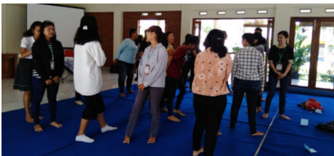
The excitement of the members of the SaMuda Community during the ice breaking activity