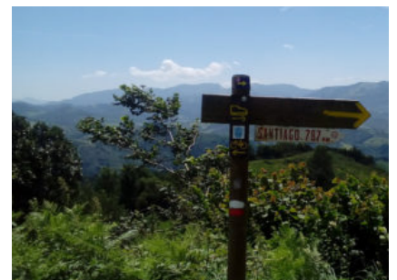
A marker with the distance after two days walking: still 787 kms to Santiago.

Continue reading Sr Els' pilgrimage story in the Weaving One Heart: Contemporary FCJ Voices blog of the FCJ Sisters