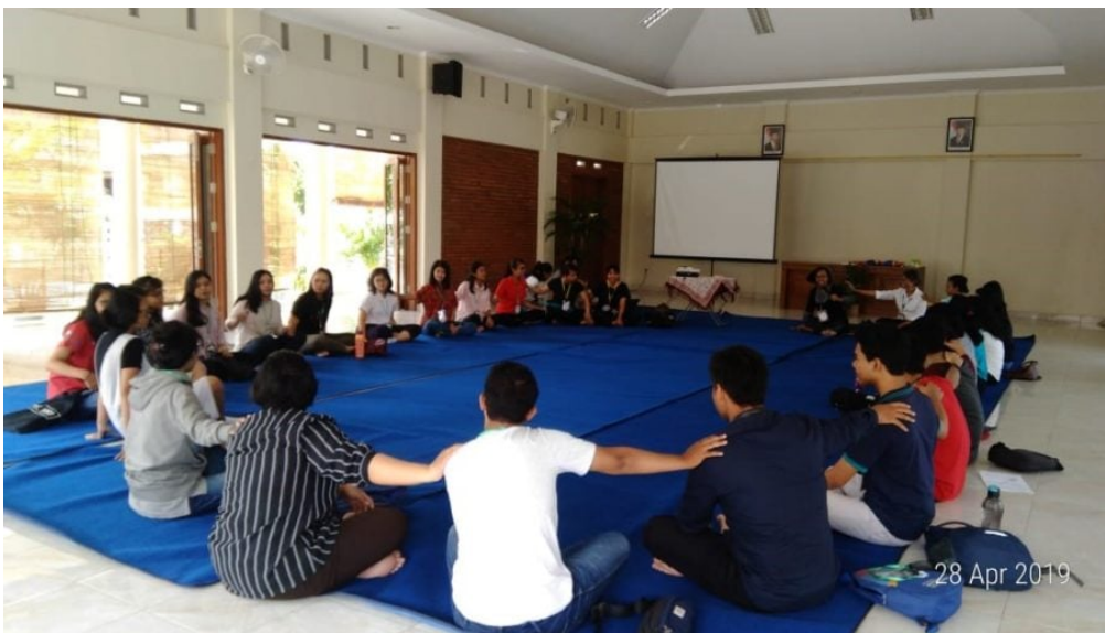
Inspiration and challenge are part of the programme given to the members of SaMuda

The meeting opened with prayer. This was a prayer with a difference, using music and movement. We then watched a small video Women on Mission which introduced the FCJ Sisters and especially the Sisters in Yogyakarta.