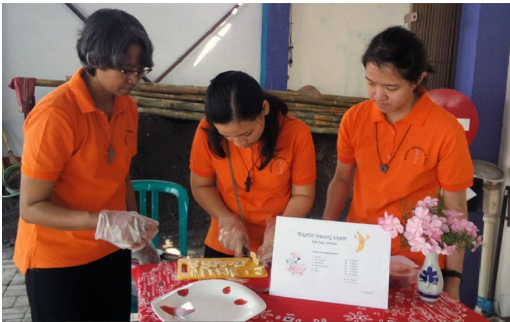
Members of the Yogyakarta community hard at work.