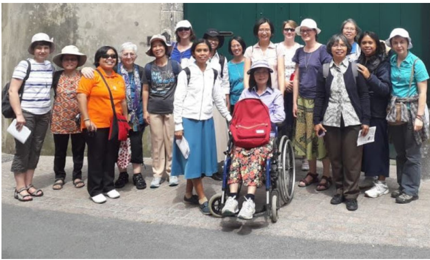
FCJ Sisters on pilgrimage in Francen July 2018.