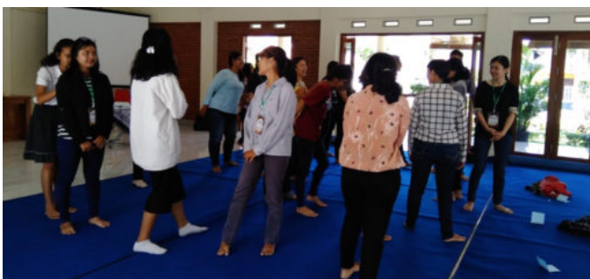
The excitement of the members of the SaMuda Community during the ice breaking activity