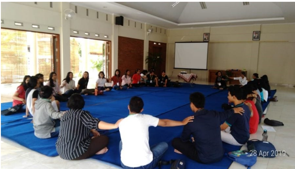
Inspiration and challenge are part of the programme given to the members of SaMuda

The meeting opened with prayer. This was a prayer with a difference, using music and movement. We then watched a small video Women on Mission which introduced the FCJ Sisters and especially the Sisters in Yogyakarta.