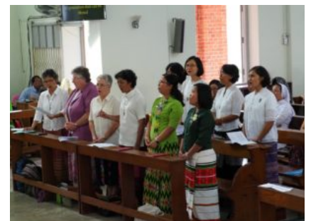
FCJ sisters singing the Magnificat at a vow ceremony in Myanmar

At the midpoint of the mass they both said their vows in clear, bold voices. When they returned to their seats, they and the FCJ sisters present (ten of us altogether) stood to sing, acapella, the “Magnificat”, a song from the scriptures attributed to Mary, glorifying God for his blessings. “My soul does magnify the Lord, and my spirit has rejoiced in God my Saviour...” Our voices together seemed to rise up and fill the cathedral, an almost tangible expression of our joy and gratitude in that moment. Later some people were to comment that that singing touched them deeply, coming as it evidently did from the heart.