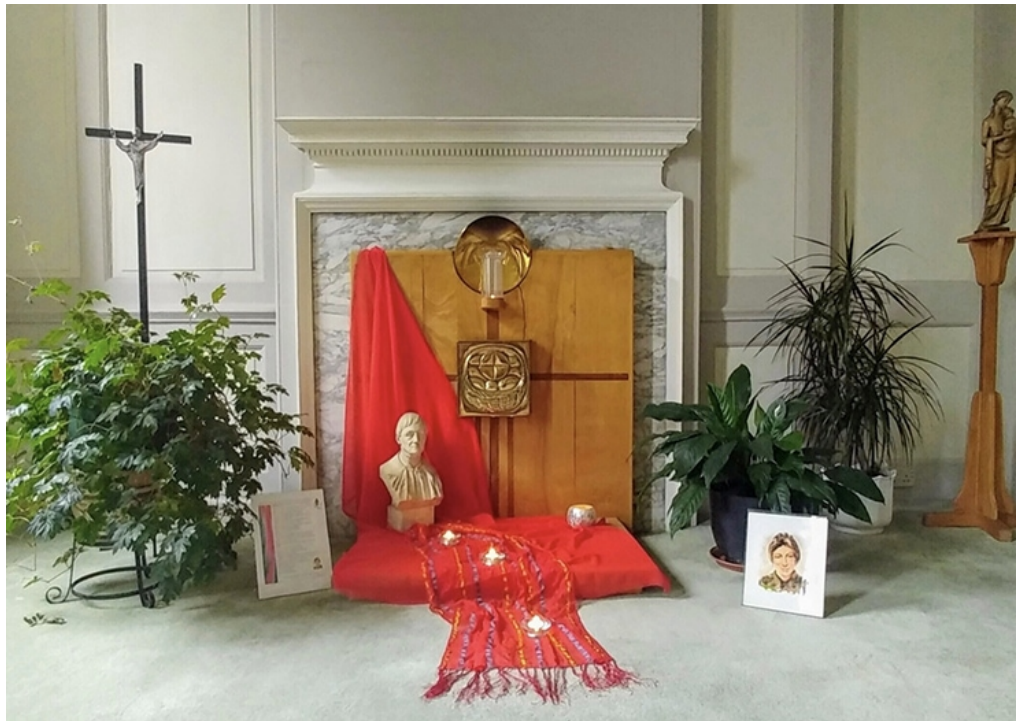
The chapel at Gumley House Convent on the day of St John Henry Newman's Canonisation.

The canonisation was celebrated in other FCJ communities in England. This is a photo of the chapel of Gumley House, the FCJ Generalate , on the day of the St John Henry Newman's canonisation.