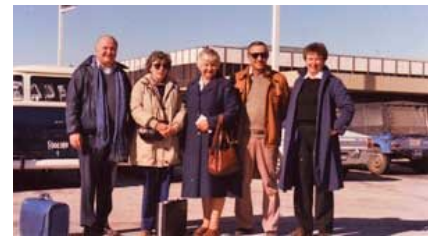
The first FCJs to live and work in South America established the house in Córdoba, Argentina, in 1985, in a poor parish on the outer rim of this city, the second largest in Argentina, working with the La Salette Missionaries

Read more about the history of the Faithful Companions of Jesus in the Americas and in Asia .