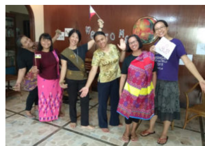
Some of the FCJ sisters of the Manila community.

Lord, God of all peoples, We mark this day To declare not our independence, but our interdependence. We are all created by the same God And share the same eternal destiny. We are called to live together in harmony and peace, As one family in the Lord. May we learn to love, To accept and to forgive, To heal and to nurture, And to celebrate all the beauty in diversity Of the earth we call home. We ask this through Christ, our Lord. Amen.